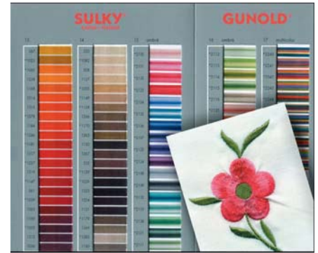
SULKY-colour card ... embroidered with SULKY

SULKY® is introducing 32 new colours bringing the total available colours to 390. Most important is that the thread colour showing on the colour card is identical to the thread delivered. This critical consistency is clearly the result of two factors: first, the ENKA viscose; and second, the fact that GUNOLD has invested in innovative and state-of-the-art manufacturing processes as they dye and twist SULKY® thread at one of the most modern factories in Europe.