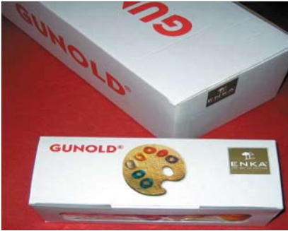
GUNOLD is authorized to advertise their thread with the ENKA gold label on their packing – only SULKY is made of 100% ENKA viscose in all colours