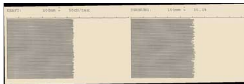
SULKY viscose at stress-elongation test: high tensile

Regarding resistance to tearing or abrasion, there is nothing better. This also applies to the