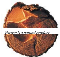
Viscose is a natural product

The source material for manufacturing cellulose is wood. It takes about 20 years before a single tree matures to meet the high ENKA quality requirements. Long-chain cellulose molecules are the best basis for further processing of cellulose to viscose. For manufacturing viscose, the solid pulp is first converted into liquid during a chemical conversion process. With the help of the finest spinnerets, this so-called spinning solution is continuously spun into an endless thread, the viscose filament thread, which results in an unmatched silky shine, smoothness and softness.