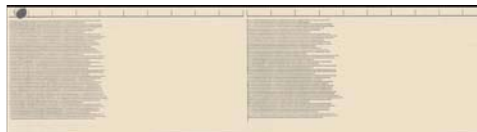
"No name" viscose at stress-elongation test: different lengths prove the lower tensile strength

low level of lint, the consistent evenness, and low frequency of breaking. SULKY® breaks less frequently with increased sewing speed than a "no name" viscose and SULKY® also "forgives" wrong thread tension.